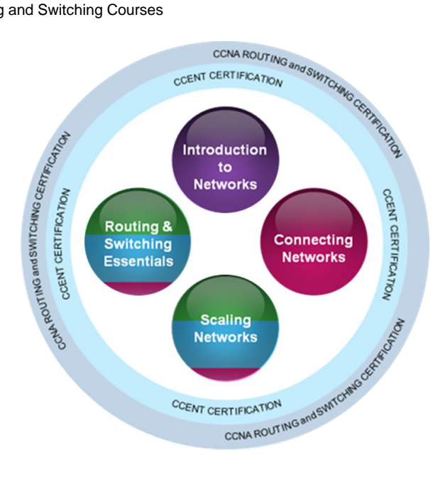
Figure 1. CCNA Routing and Switching Courses

The CCNA Routing and Switching curriculum consists of four courses that make up the recommended learning path. Students will be prepared to take the Cisco CCENT® certification exam after completing a set of two courses and the CCNA Routing and Switching certification exam after completing a set of four courses. The curriculum also helps students develop workforce readiness skills and builds a foundation for success in networking-related careers and degree programs. Figure 1 shows the different courses included in the CCNA Routing and Switching curriculum.